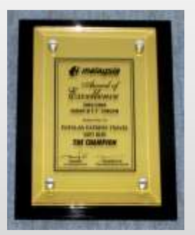
Malaysia Airlines "The Champion" 2003 /2004