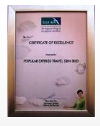
Silk Air "Certificate of Excellence" 2012/2013