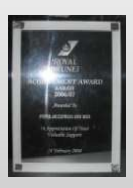
Royal Brunei Airlines "Achievement Award" 2006/2007