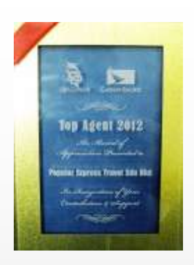
Dragon Air & Cathay Pacific "Top Agent" 2012