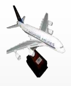
Silk Air "Top Agent" 2008/2009