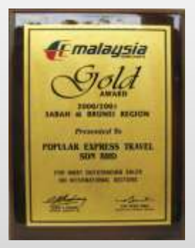
Malaysia Airlines "Gold Award" 2000 /2001