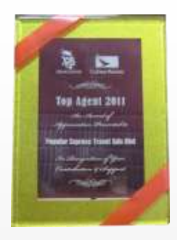
Dragon Air & Cathay Pacific "Top Agent" 2011