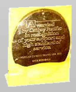
Cathay Pacific "High Standard Service" 2007